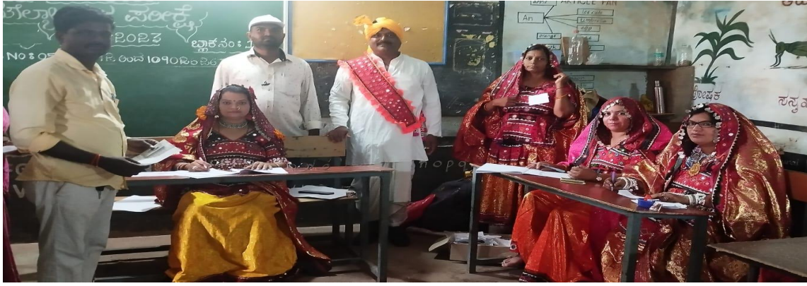
Polling officials in ethnic attire at the theme-based polling station in Kalghatgi Constituency PS No. 105