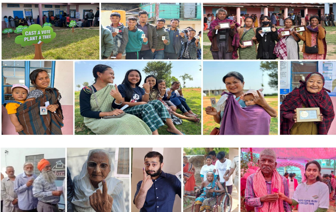
Glimpses of voters from the bye polls in Meghalaya, Punjab & Odisha

Polling was also held today 04-Jalandhar (SC) PC of Punjab, 07-Jharsuguda AC of Odisha, 395- Chhanbey (SC) AC of Uttar Pradesh to fill the vacancies due to death of sitting candidates; 34-Suar AC of Uttar Pradesh due to disqualification of sitting candidate and 1 adjourned poll in 23-Sohiong(ST) AC of Meghalaya due to death of contesting candidate. Voting percentages of 50.27% for Jalandhar; 68.12% from Jharsuguda; 39.51% from Chhanbey (SC) ; 41.78% from Suar and 91.39% from Sohiong(ST) was reported by 5pm.