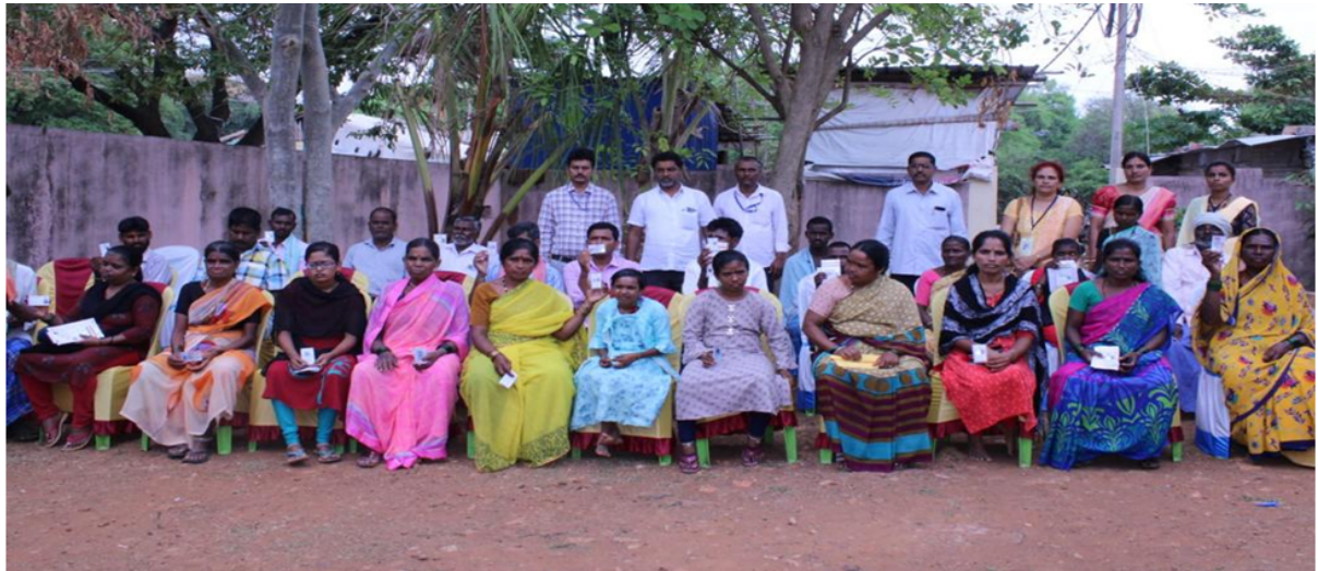
25 PwD Voters from Kondajji village of Harihara AC came together and casted their vote in Davanagere Dist.