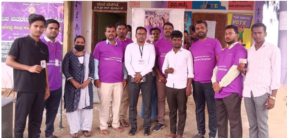
Youth managed polling station in 38- Yadgir AC

Wide use of cVigil app was reported to register and resolve complaints within a response time of 100 minutes. Till May 9, 2023 (5 PM), out of a total 18,321 complaints received, 16,551 were found to be correct and have been disposed of. Maximum complaints were received from Bagalkot (3511) and Chitradurga (2314) districts while least complaints were received from Chamrajnagar (20) and Yadgir (35) districts. Amongst the different categories, maximum complaints were received for posters/banners put up without permission ( 10,695). Out of 439 complaints received for property defacement, 436 were found to be correct; Out of over 700 complaints