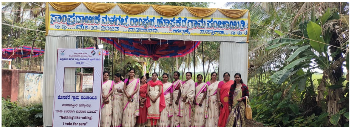
Ethnic polling station in Rampura, Hosakere village, Mandya District

Tentative figures of voting of nearly 65.69% (5pm) were reported from Karnataka. Voters who reach Polling stations till the end of poll hour are allowed to cast their vote. Many voters were seen to be in queue at 6pm also.