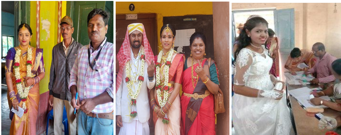
Newly weds, brides casting their vote at the polling stations

Newly weds to the newly born, group of PwDs, transgenders & tribals in specifically set up ethnic polling booths added to the vibrant and largely peaceful polling held today, across 224 ACs spread over 58,545 polling stations (including auxiliary PS), for General Elections to the State Legislative Assembly of Karnataka. Voters across the state were seen participating enthusiastically and casting their franchise in the festival of democracy.