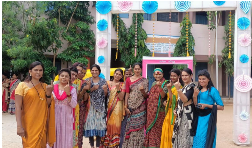
Senior Citizens, PwDs and Transgender Voters at the polling stations

Child care centres were arranged across all polling stations - glimpses from Haveri district to facilitate women voters with kids included here.