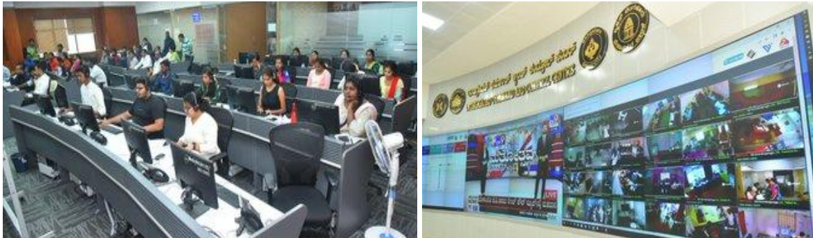
Integrated Control and Command centre at BBMP for monitoring of PS in 28 ACs