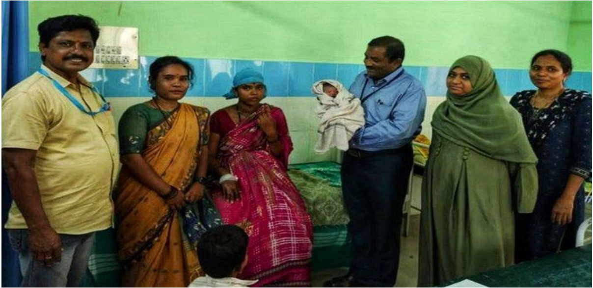
A 23 yr old woman gave birth to a baby in a polling booth in Kurlagindi village of Ballari. Female officials and women voters helped to deliver the baby.